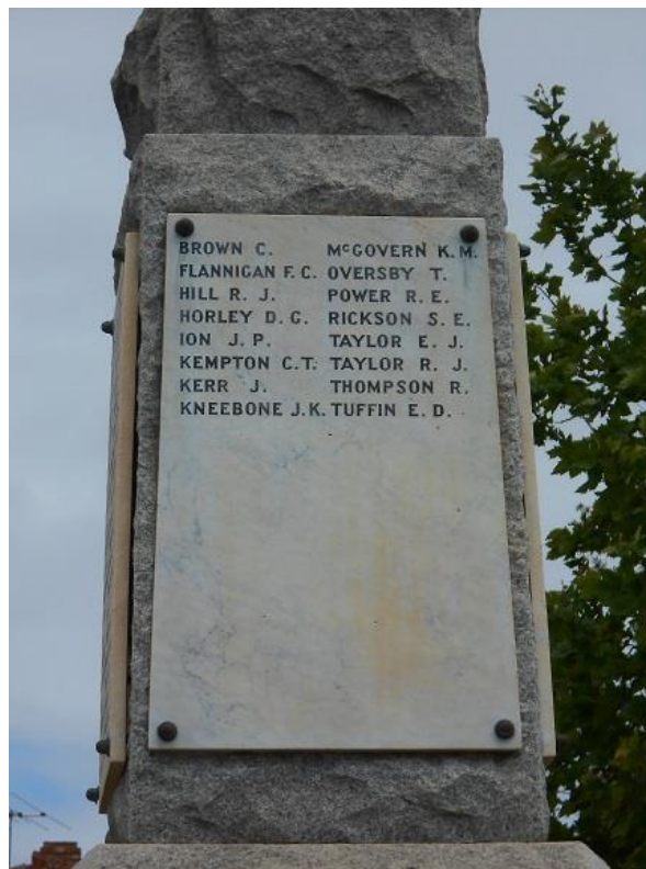
West Leederville War Memorial & the existing back panel where the additional 50 names will be added.