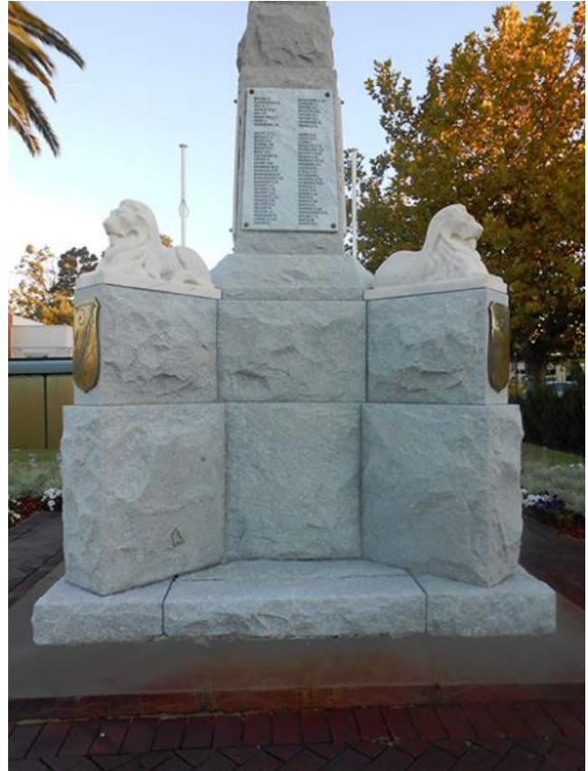
West Leederville War Memorial

An article in the local newspaper the Cambridge Post , February 21, 2015 –